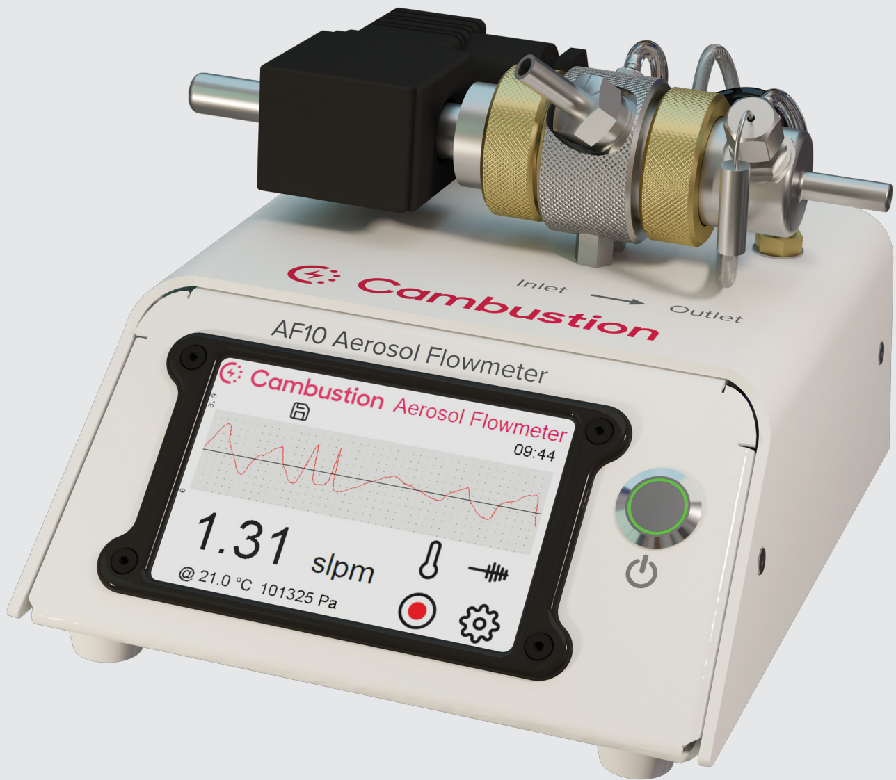
The new Cambustion AF10 precision orifice aerosol flowmeter